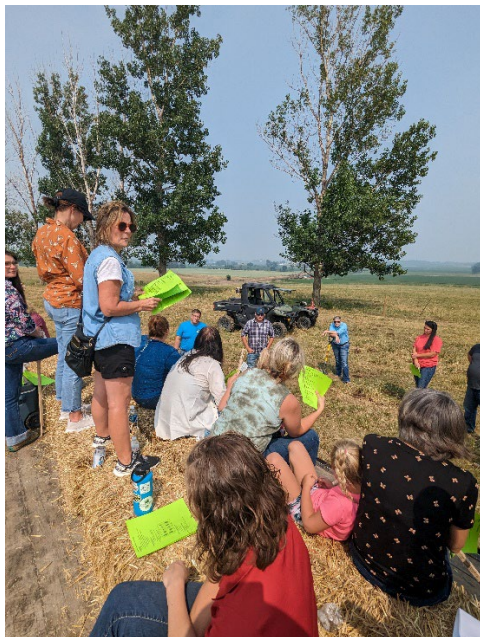
June 2023 Jones and Delaware WLL Chapter Pasture and Grazing Event.

During the 2022 study, women shared interest in the carbon credit programs, soil erosion control, soil fertility management and cover crops. They prefer a mix of in-person and virtual events.