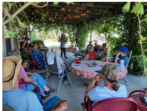
June 2023 Tama County WLL Pollinator event.