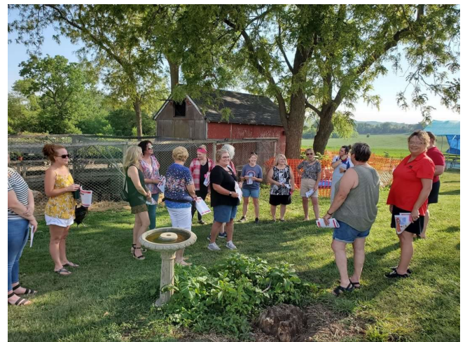
June 2023 SW Iowa WLL Chapter event.

A 2022 farmland study shows that 47% of Iowa's farmland is owned or co-owned by women, which equals 46% of Iowa's farmland acres! Women are still somewhat overlooked, although that dynamic is slowly improving, thanks to organizations and programs such as Women Food and Agriculture Network (WFAN) and Women Land and Legacy (WLL).