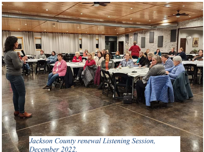
Jackson County renewal Listening Session, December 2022.