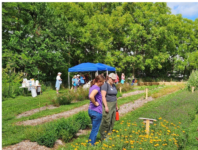
Iowa WLL and Cedar, Johnson, Muscatine, and Scott WLL jointly held the Hemp Farm Tour Learning Session, August 2023.